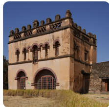
Royal Library (40, -30)