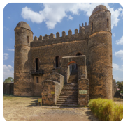
Great Stairs (10, -20)

Plot each ordered pair on the treasure map.