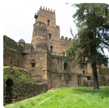
High Tower (?, ?)