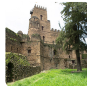
High Tower (?, ?)