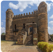
Great Stairs (10, -20)