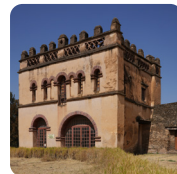
Royal Library (40, -30)