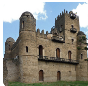
Palace (-50, -20)