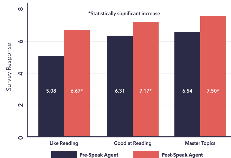
Changes in Class-Average Engagement & Confidence Indicators

Students took a pre- and post-survey centered on social-emotional competencies in engagement, confidence, and growth mindset. There were three components where there was a statistically significant increase in the class-average response: how much students like reading, how good at reading they think they are, and how confident they are that they can master topics in their class (figure below). There was not a statistically significant increase among any of the other growth mindset indicators.